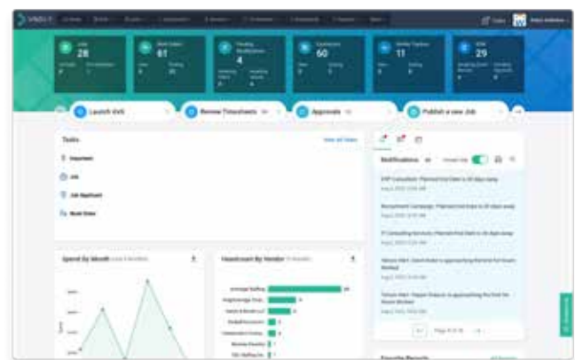
Access complete programme visibility from the Workday VNDLY home screen.