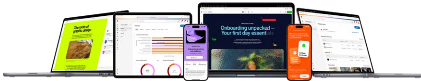
Workday Learning, powered by Sana across devices.

Workday Learning, powered by Sana, brings these capabilities together in a unified platform that's built on trusted Workday data. Learning becomes personalised and contextual for employees, AI-powered authoring accelerates course creation for content teams, and learning operations run at scale with built-in governance and compliance.