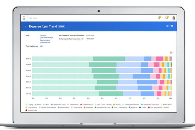
Powerful, real-time visibility and control over organisational spend.