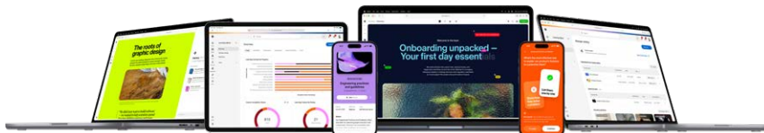
Workday Learning, powered by Sana across devices.

Workday Learning, powered by Sana, brings these capabilities together in a unified platform that's built on trusted Workday data. Learning becomes personalized and contextual for employees, AI-powered authoring accelerates course creation for content teams, and learning operations run at scale with built-in governance and compliance.