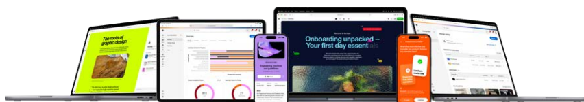
Workday Learning, powered by Sana across devices.

Workday Learning, powered by Sana, brings these capabilities together in a unified platform that's built on trusted Workday data. Learning becomes personalized and contextual for employees, AI-powered authoring accelerates course creation for content teams, and learning operations run at scale with built-in governance and compliance.