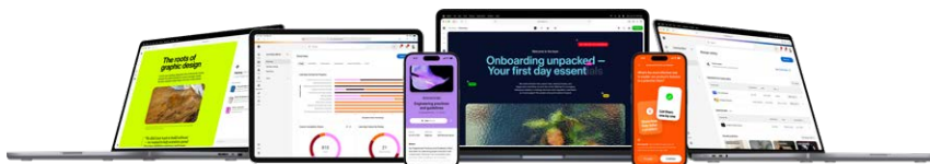
Workday Learning, powered by Sana across devices.

Workday Learning, powered by Sana, brings these capabilities together in a unified platform that's built on trusted Workday data. Learning becomes personalized and contextual for employees, AI-powered authoring accelerates course creation for content teams, and learning operations run at scale with built-in governance and compliance.